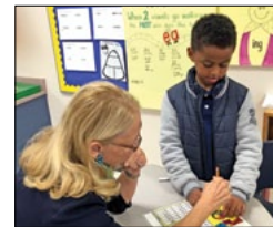
Houston Pi Beta Phi Foundation site visit at Making it Better.

Lunch Bunch: A weekly program where trained volunteer mentors promote positive decision making and healthy relationships for third through fifth grade students. To find out more about these programs and Making It Better, please visit their website at www.mibt.org .