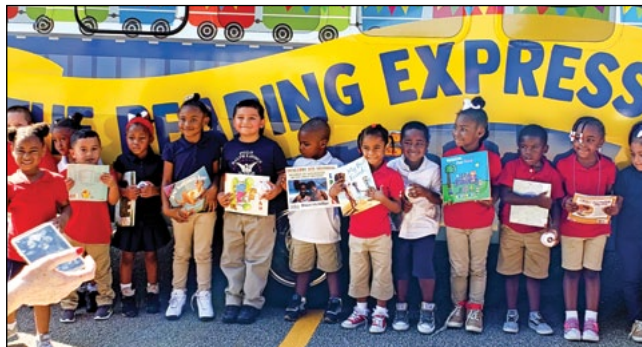
The Reading Express, Making it Better's newest program.