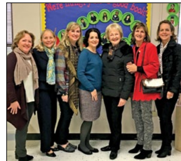
Houston Pi Beta Phi Foundation site visit at Making it Better.