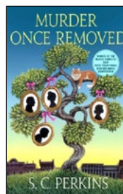
Murder Once Removed cover.

Partly, at least. Using clues from the journal, Lucy narrows the suspects down to two 19 th Century Texans, one of whom is the ancestor of present-day U.S. senator Daniel Applewhite. But when Gus publicly outs the senator as the descendant of a murderer—with the accidental help of Lucy herself—and her former co-worker is murdered protecting the daguerreotype, Lucy will find that shaking the branches of some family trees proves them to be more twisted and dangerous than she ever thought possible.”