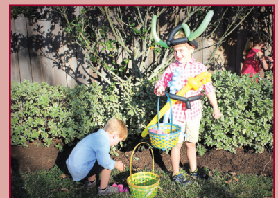
Egg hunting at the annual Easter children's event!

April 4 Bible Study Group 12:00 p.m. Home of Becca Schwinger 3 Pine Grove Circle (77024)