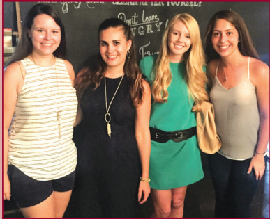
Junior Group members