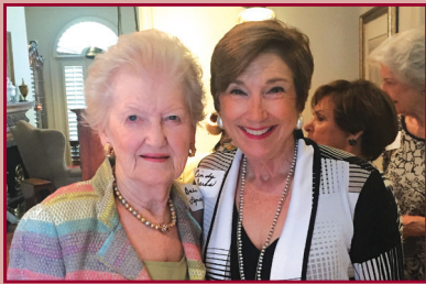
Golden Arrow members