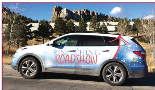
Ring Ching Roadshow is coming to Houston.

MARCH Turn Pi Phi's International Day of Literacy-related service into an entire month of service. Kick off the month with our Houston Alumnae Club Fraternity Day of Service , scheduled for March 2 at the Children's Museum of Houston. From there, seek out opportunities to promote literacy in your own community: read to